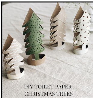
Ask an adult cut out shapes to make a tree, then paint and decorate it.