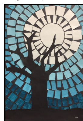
Create a silhouette using collage techniques