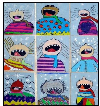
How about these silly, snow eating self-portraits using coloured pencil or felt-tips! Yum!