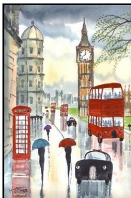
A wet wintery London