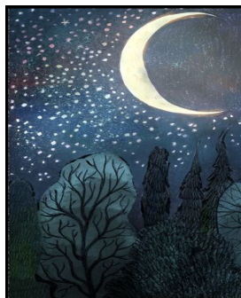
Create a magical forest blending a chalk pastel background.