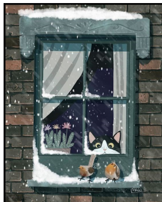
Draw a fun house window with a festive theme.