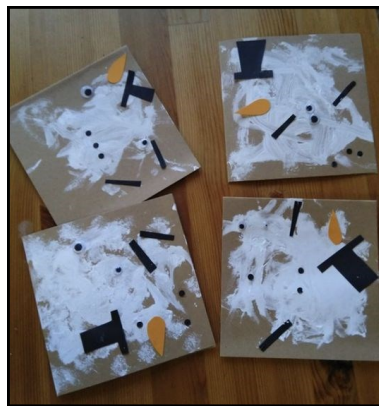
Check this "melted" snowman art, with cut out card, hat, nose and eyes!