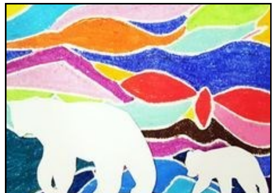
Create a piece of abstract art, inspired by polar animals.