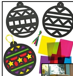
Make a stained glass decoration using black card and tissue paper