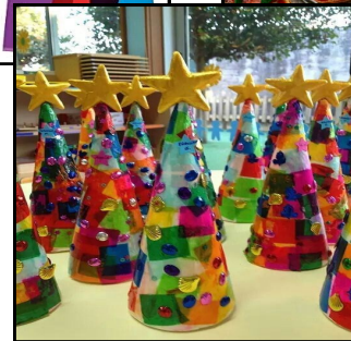
Make a paper cone and decorate it to make a tree decoration.