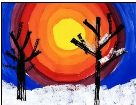
Paint a snowy scene using paint, with sponge prints for snow in white and twig prints for paint in black.