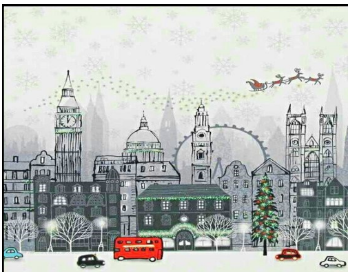
Look at London landmarks on your devices to create a drawing of London in December