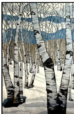
Draw a Birch Tree forest