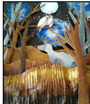
Use cut cardboard to create the wintery scene.