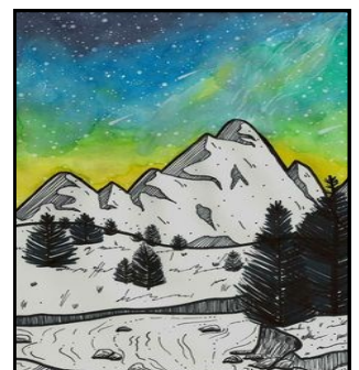
Create this simple landscape using a hand-writing pen and paint/coloured pencil.