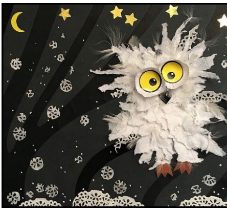
Try making this Snowy Owl collage, using ripped kitchen towel, cupcake eyes and bits of doily for snow.