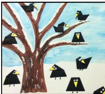
Make a snowy, crowie scene!