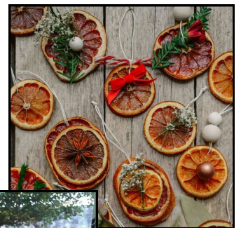
Make aromatherapy decorations by slicing some citrus fruit, drying them out and add spices like star anise and cinnamon.